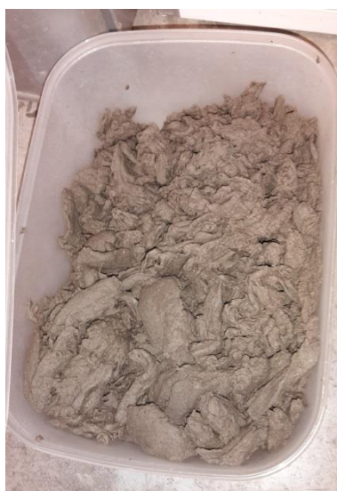
Example of MSW pulp from the washing process